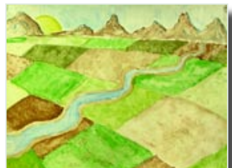
Watercolor by Ian Buchanan